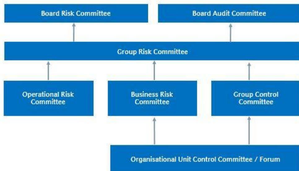
Figure 1: Overview of the Operational Risk Governance Structure

Note: In addition to escalating matters as necessary to the Group Risk Committee, the Group Control Committee reports to the Board Audit Committee.